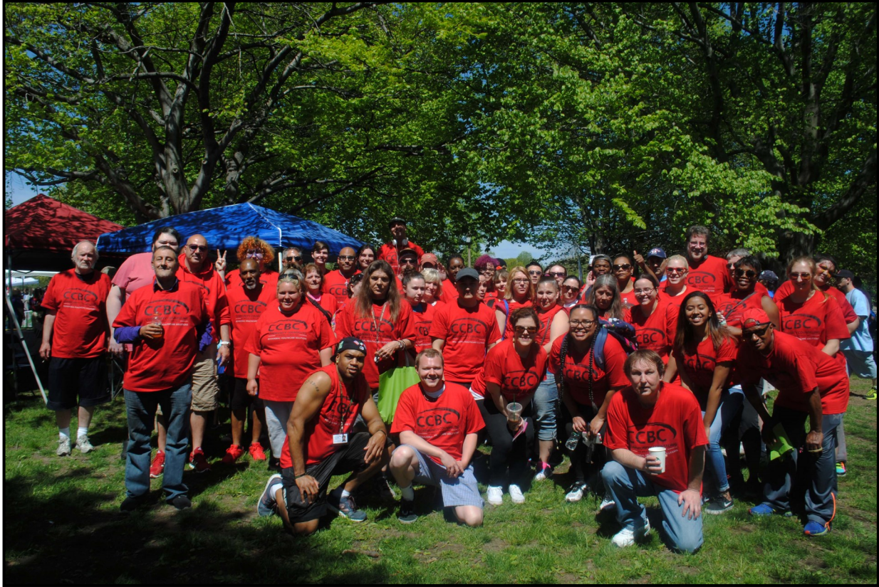
Team CCBC at the 2016 Annual NAMI Walk